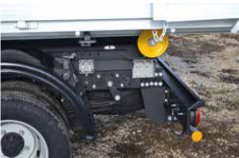
EASY AND EFFICIENT MOUNTING

The CiTy is ex-works final coated: Grey unit, black cylinders, yellow rear pulleys and arm. Small mechanical parts are zinc nickel treated.