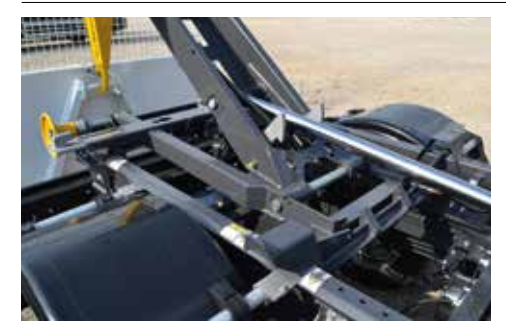
LONGEVITY AND RELIABILITY

The ergonomic and intuitive cab controls are easy to handle. 2 additional functions: Diagnostic mode and emergency mode